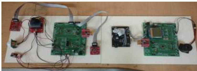
Figure 3. Implementation of smart dust

The coordinator mote acts as the base station in a peer to peer wireless network model and will be powered by a larger battery or by mains power. Wireless sensor network is constructed based on IEEE 802.15.4 low-power wireless network protocol. A 32-bit ARM Cortex-M3 microcontroller is used as the brain of all these sensor and coordinator motes. Each mote will consume little power to stay longer and will be fuelled by a tiny battery. A separate ARM Cortex-M3 microcontroller will be used to interface and process the camera images from the vision sensor.