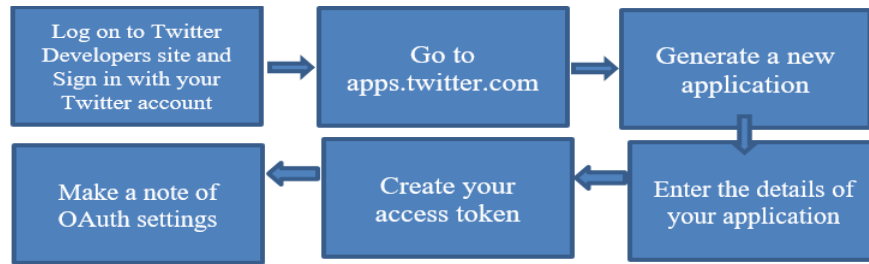
Figure 1. Pictorial view to register in application on Twitter API