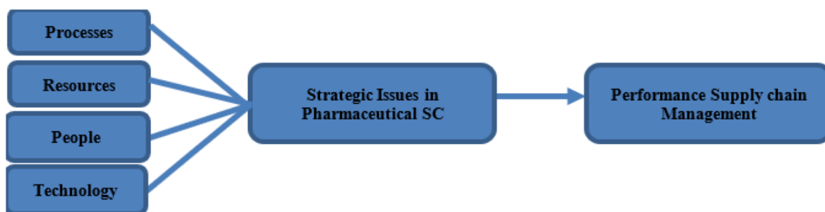
Figure 1. Research framework

The development of strategies and the optimization of support systems for decision making in product management is necessary to reduce risk, market time, optimize the objectives to accommodate the levels of greatest complexity [24, 25] the strategic aspects in the analysis of the competitiveness of the supply chain of the pharmaceutical industry can be exploited in Asset 25, processes and performance [26], people or interested persons [27-29] and technology [30] to improve the performance of the management of the supply chain. The researchers develop strategies for managing the supply chain with an important component that can be seen in Figure 1.